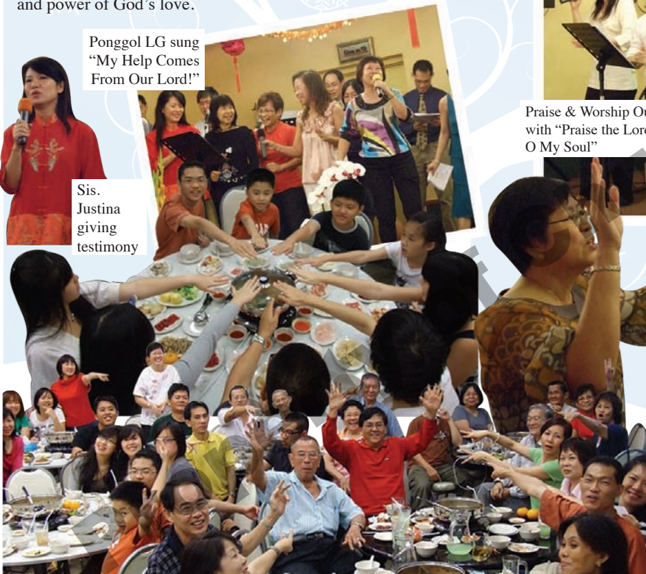
A Reunion To Remember

600 Ponggol Seventeenth Avenue, Marina Country Club, Marina View 2 nd Level, Singapore 829734 Tel: 6387 6612 / 9646 0704 / 9771 0250 Website: www.cosk.sg