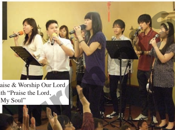
Praise & Worship Our Lord with "Praise the Lord, O My Soul"